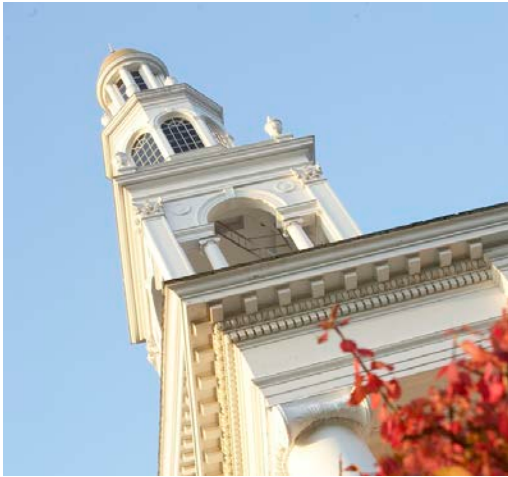
Ira Allen Chapel