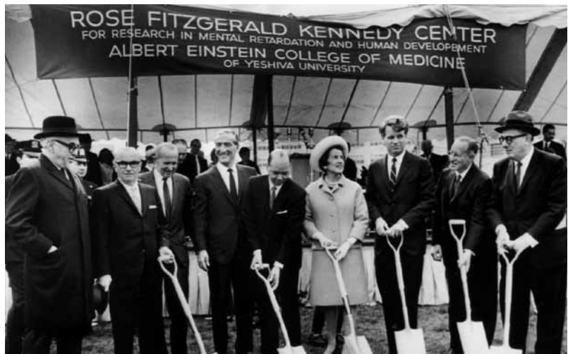
Groundbreaking ceremony for Rose F. Kennedy Center, in 1966