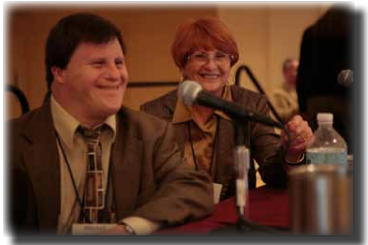
AUCD Conference presenters share a laugh with the audience

AUCD envisions a future in which everyone, including persons living with developmental and other disabilities, is a fully integrated and participating member of their community. It is our mission to advance policy and practice for and with people with disabilities, their families, and their communities by supporting our members in research, education, and service activities that achieve this vision.