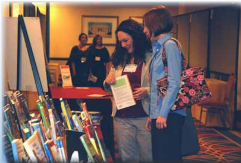
Conference attendees shop at a sponsor's exhibit

There are few greater efficiencies in our field than building on the ideas of others, learning what to do and what not to do in developing programs, and gaining invaluable insights into what works and why. Become a sponsor of the AUCD Annual Meeting and Conference today, and share in making what works accessible to all!