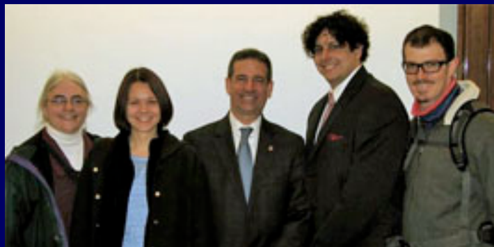
Wisconsin and Ohio trainees on Hill visits 2007