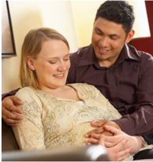
In Cache County, the study will eventually follow 1000 births.

In northern Utah, enrollment will soon begin on a landmark study to better understand the interactions between environment and child health and development. Researchers from the Center for Persons with Disabilities will soon begin enrolling participants for the Cache County location of the National Children's Study. Their work will contribute to an enormous effort to gather data on more than 100,000 children nationwide from pre-birth to age 21. It will be the largest database ever collected on children as they develop,