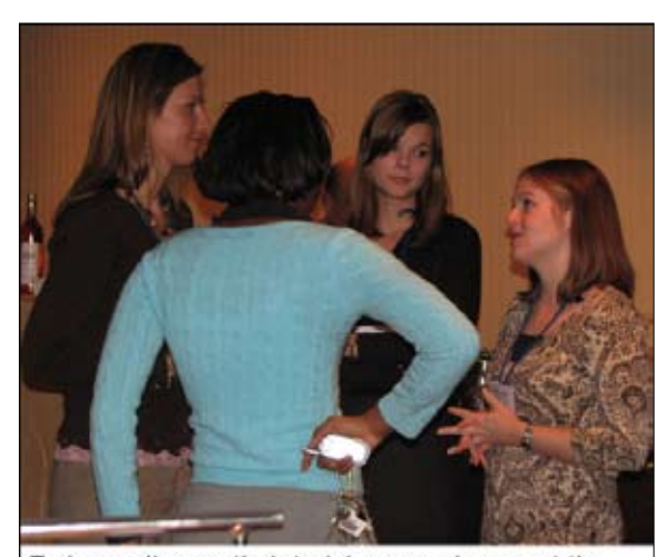
Trainees discuss their training experiences at the AUCD 2006 Annual Meeting.